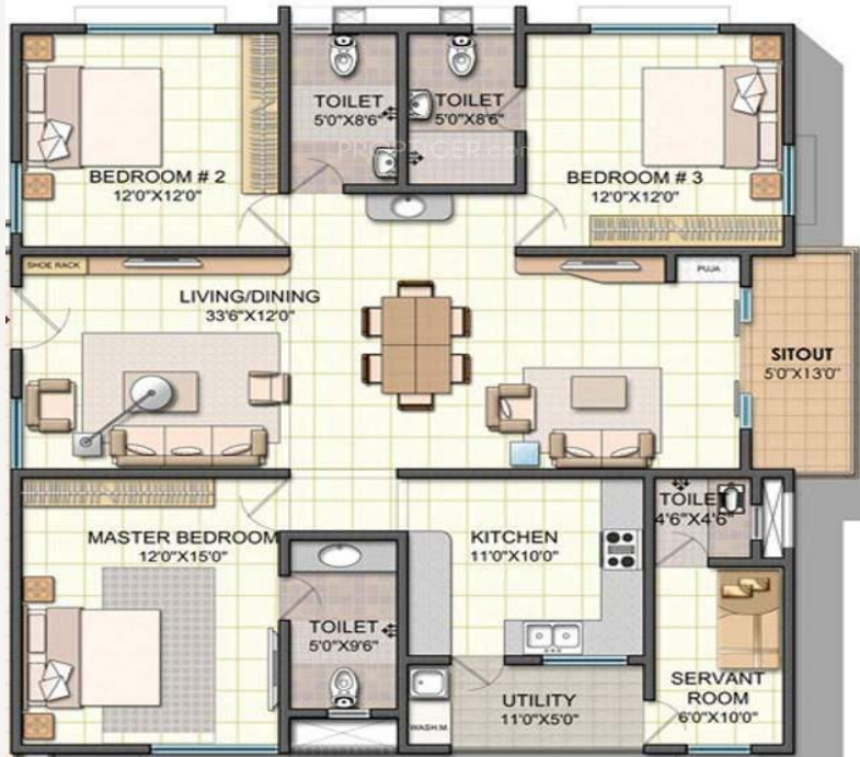
3 BHK Tentative Plan

Contribution for Land Cost @ Rs.1800/- Per sq ft